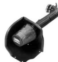
FLOWMASTER FLOWMASTER DELTA FORCE PERFORMANCE AIR INTAKE