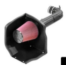
FLOWMASTER FLOWMASTER DELTA FORCE PERFORMANCE AIR INTAKE