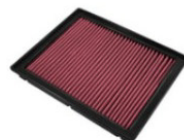
FLOWMASTER FLOWMASTER DELTA FORCE PERFORMANCE PANEL AIR FILTER