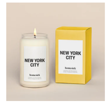
New York City Candle