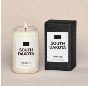
South Dakota Candle

River Water, Prairie Crocus Flower, Sandalwood