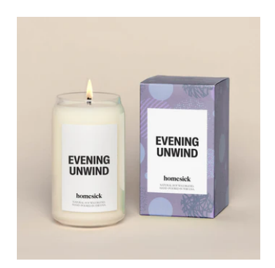
Evening Unwind Candle

Great choice! Bet you'll love these too.