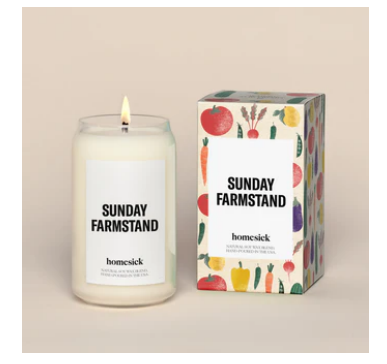
Sunday Farmstand Candle