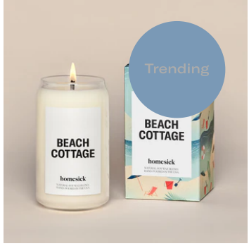
Beach Cottage Candle