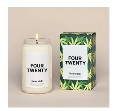
Four Twenty Candle

Great choice! Bet you'll love these too.