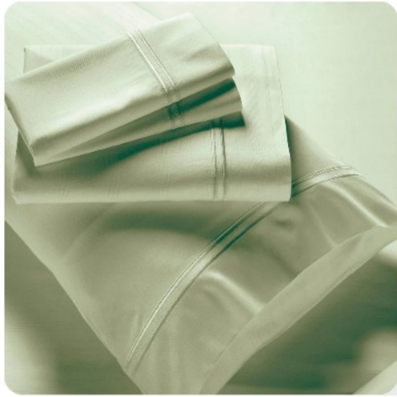
Bamboo Rayon Sheets