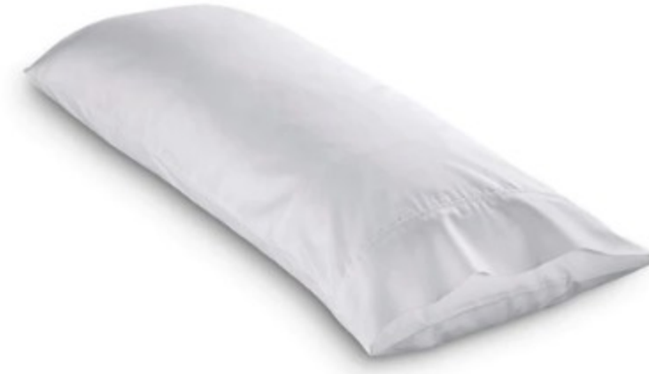
Cooling Body Pillow