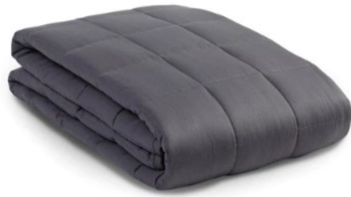
15 lb Weighted Blanket