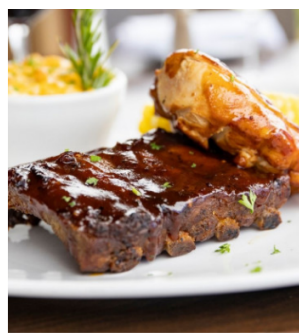
Smokehouse BBQ Plater | $40