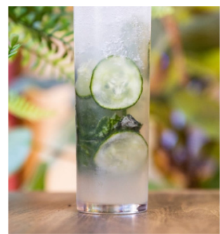
Cucumber Basiljito | $13