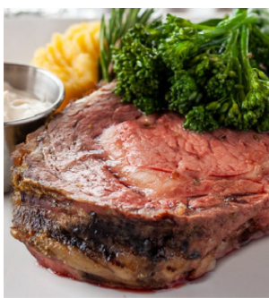
Saturday | Prime Rib | $35