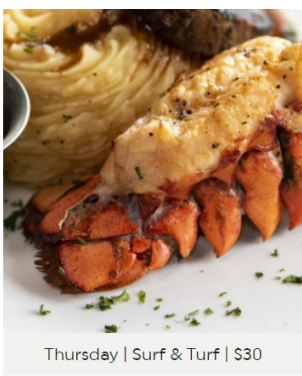
Thursday | Surf & Turf | $30