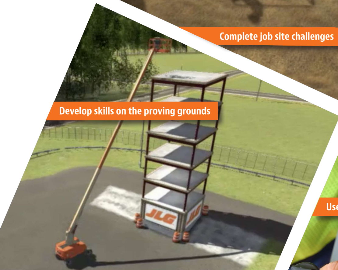
Develop skills on the proving grounds