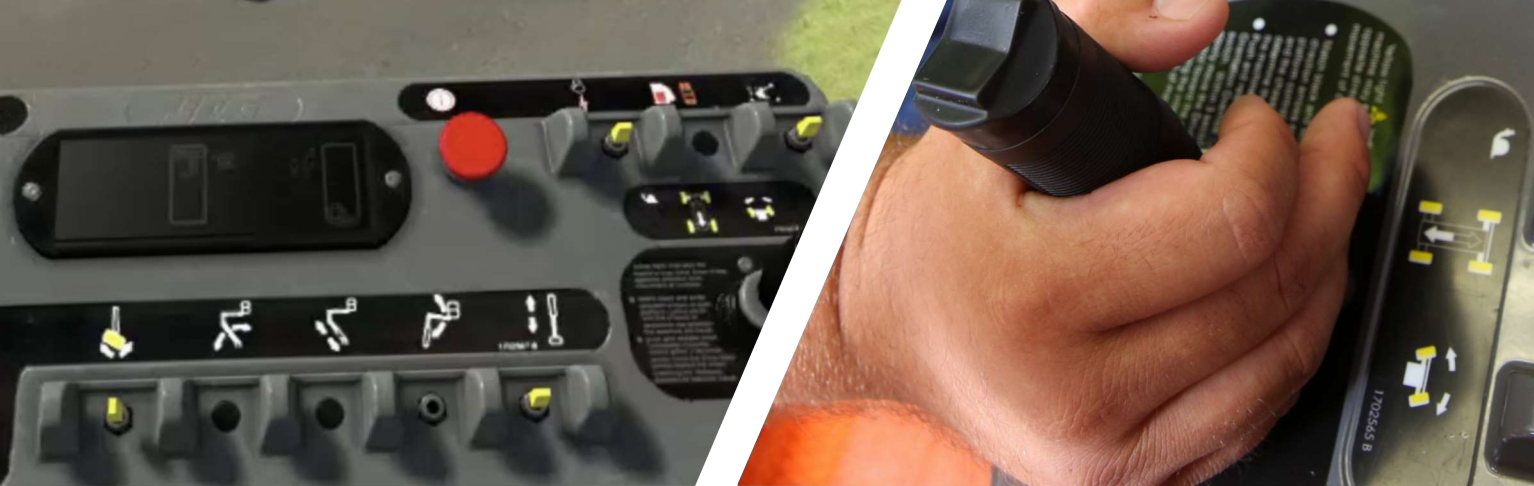
Use real-world controls