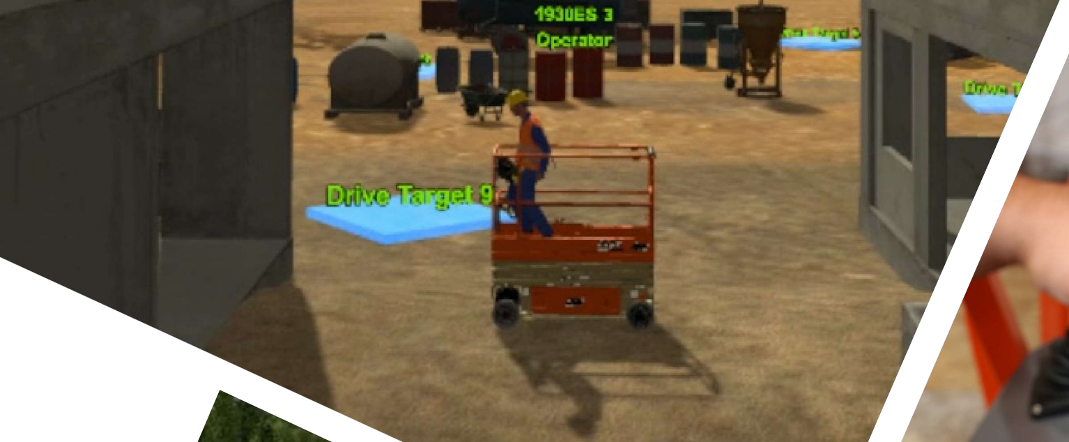
Complete job site challenges