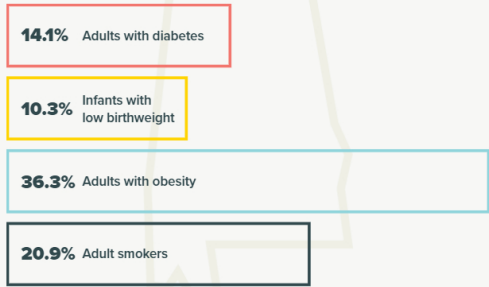
Data from America's Health Rankings (United Health Foundation)