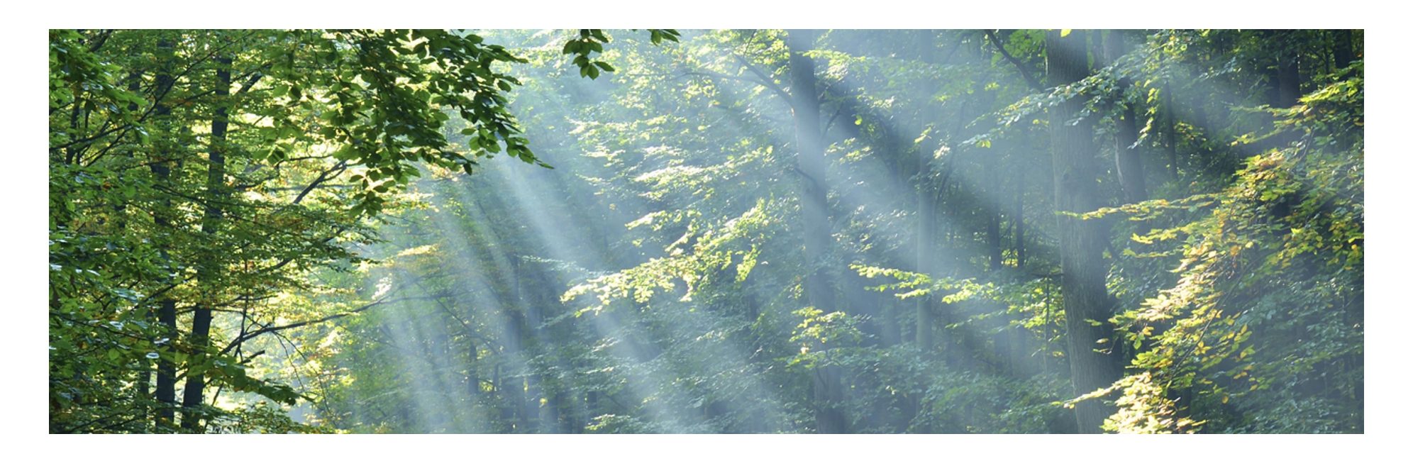
How We Can Help