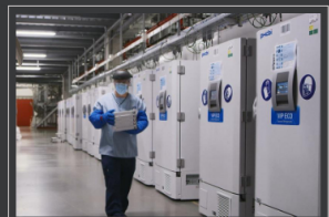
Reuters @Reuters U.S. states race to buy ultra cold vaccine freezers, fueling supply worries. https://t.co/kuhOCBK42y https://t.co/QpoHz2SrVU

SHINE Shine-A ComSonics Inc Company- Employee Owned @ShineWire Friday, November 13th, 2020 at 10:30pm SHINE's dedicated manufacturing resources toward COVID related products remains busy assisting cutting edge manufactures ramp up for vaccine distribution. https://t.co/UcUlrEweTE