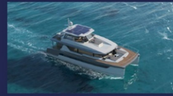
Two Oceans 555 Power Catamaran