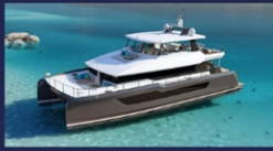
Two Oceans 675 Power Catamaran