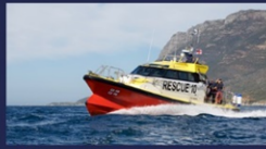
NSRI Search and Rescue Offshore Rescue Craft