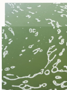
Hydrocarbon Degradator - Water $295.00