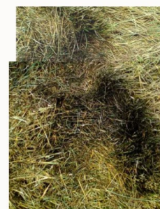
Hydrocarbon Degradator - Soil $295.00