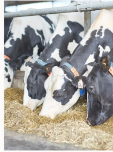
Dairy Waste Treatment $295.00