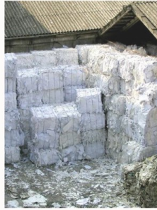
Pulp & Paper Treatment $295.00