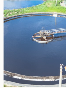
Cationic Flocculent $275.00