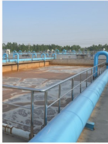
Sludge Reducer $315.00