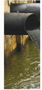
Phenol Tre from $50

← Back to Waste Water Treatment Solutions