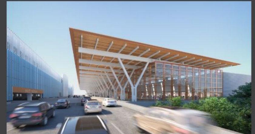
Kansas City International Airport