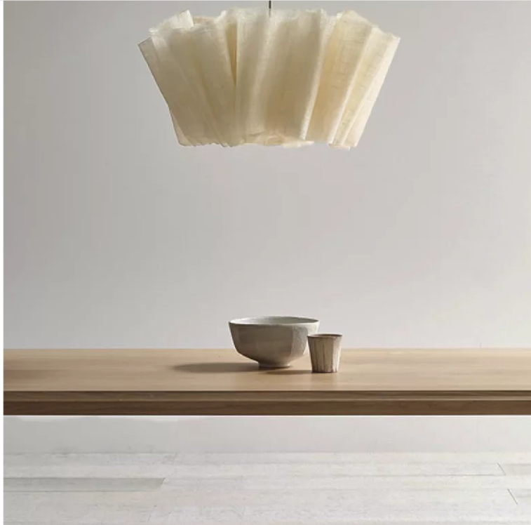
Anders light medium