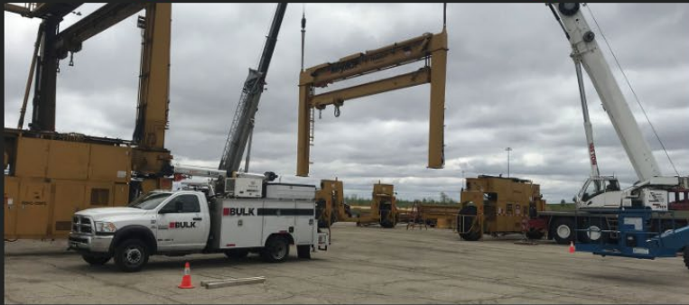
Disassembling a gantry crane