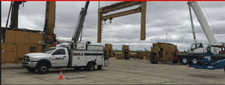
Disassembling a gantry crane