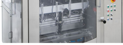
02 Vertical Form-Fill-Seal Systems