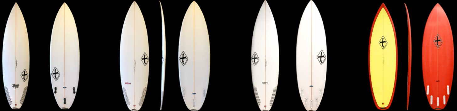
Xanadu ZANY 5'11"