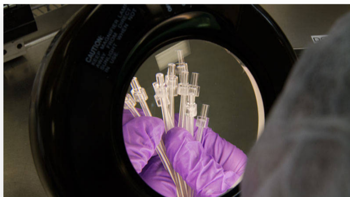
Markets We Serve