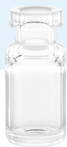
Daikyo Crystal Zenith Ready-to-Use 2mL Vials COP