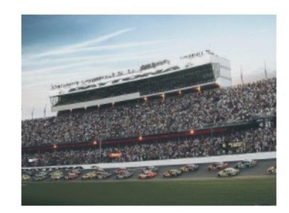
Daytona Speedway Recreation & Entertainment View the Case Study