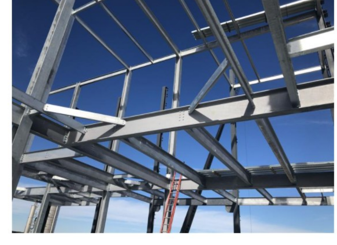
Enzyme Spray Unit Facility 2020 Excellence in Hot-Dip Galvanizing Award Winner