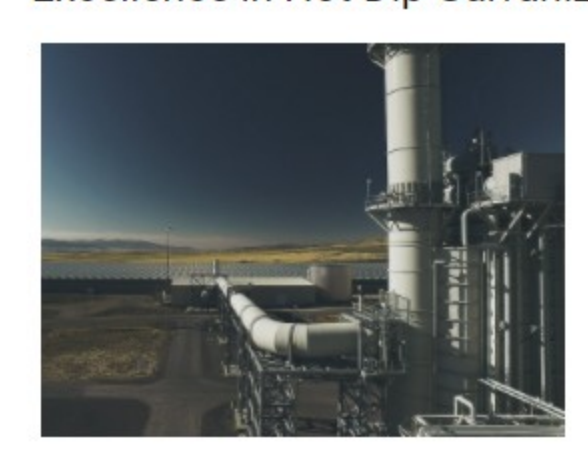
Houweling's Heat Recovery System Industrial View the Case Study