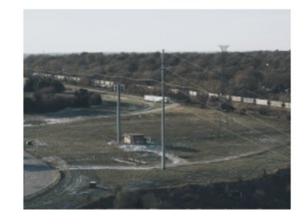
OPPD Transmission Tower Communication, Electrical, Utility View the Case Study