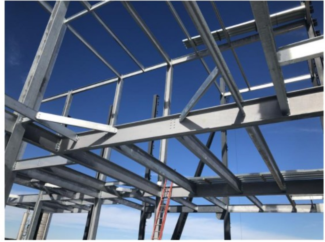
Enzyme Spray Unit Facility 2020 Excellence in Hot-Dip Galvanizing Award Winner View the full case study

Assembly Blasting Digital Order Tracking- learn more Educational Seminars Hot Alkaline Stripping Masking Packaging Smooth for Paint Storage- Outdoors Thread Chasing Transportation UV Protection Vent/Drain Holes: Burn or Drill