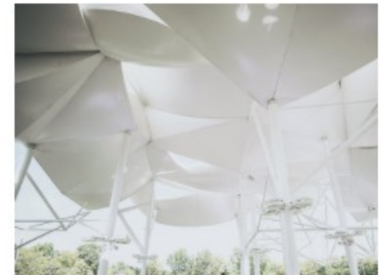
ONEOK Boathouse Duplex Coatings View the Case Study

Have questions about Valmont's coating solutions?