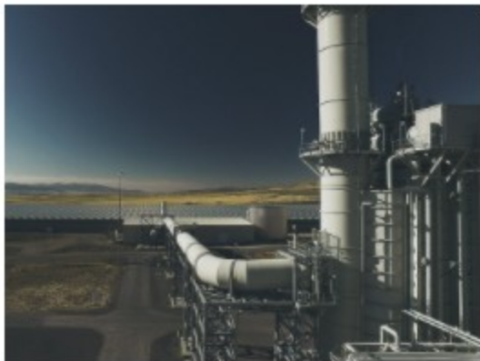
Houweling's Heat Recovery System Industrial View the Case Study