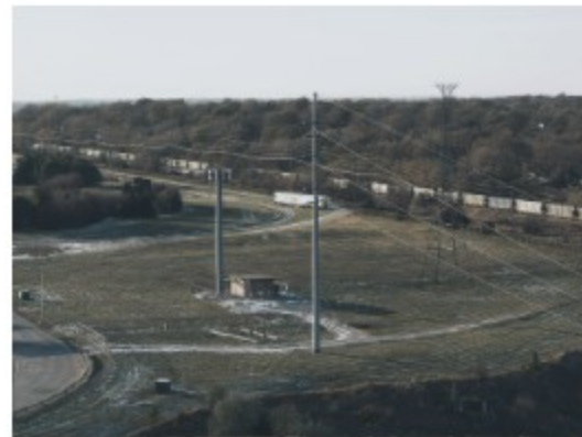
OPPD Transmission Tower Communication, Electrical, Utility View the Case Study