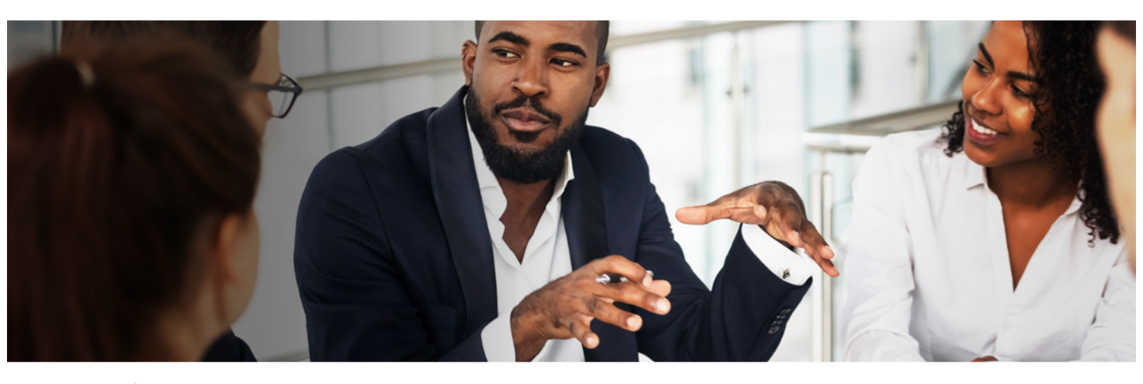
Home / Services

Healthcare Solutions | Value-Based Care Suite | Community Care Solutions | Services | Who We Serve | About us | Resources