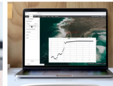
Sections and Profiles