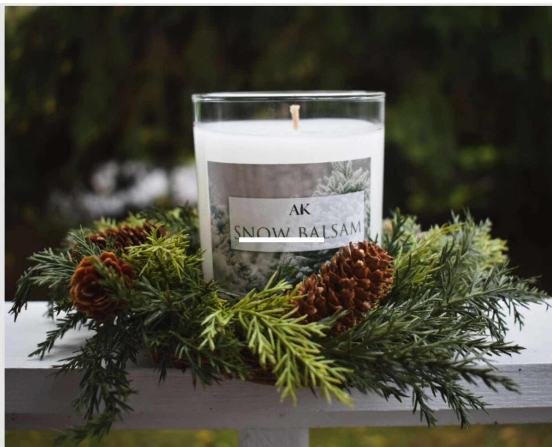
Snow Balsam Candle $20.00

Imagine a walk in the pine forest to choose a Christmas tree. There is a hint of snow in the air, and you wrap your scarf to ward off the cool, crisp chill. The fir trees are heavy with aromatic resin, and green sappy pine needles. As you trim the tree to take it home, the cedary woodiness gives depth to the scent. Decorating the tree with lady apples, clementines and spice garlands of cinnamon and clove complete the experience, combining all of the outdoor and indoor inspirations into one holiday scent.