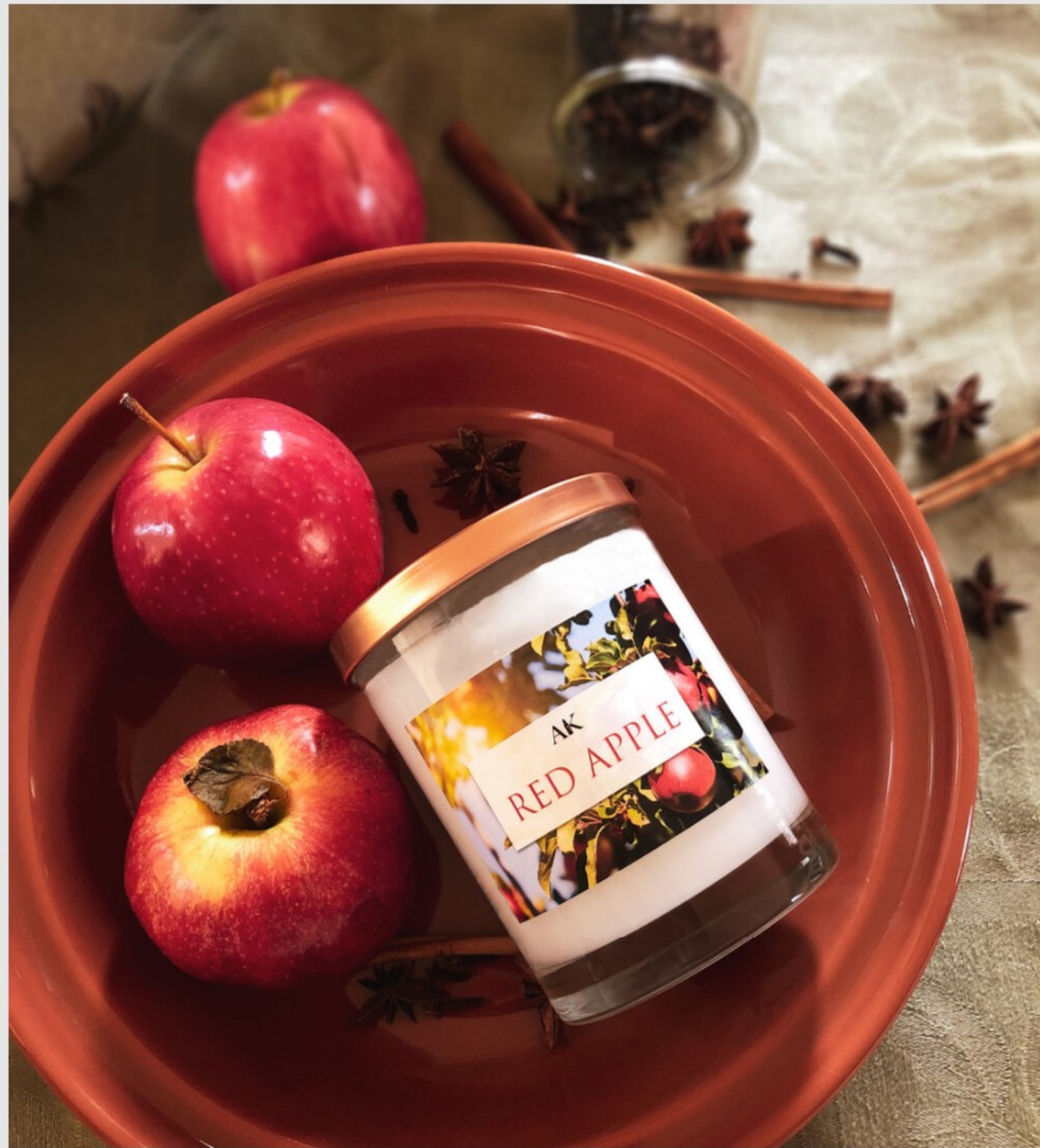
Red Apple Candle $20.00

The scent of a crisp, just-picked apple, captured in a refreshing candle. A whisper of warm sunshine and cool air finish the experience.