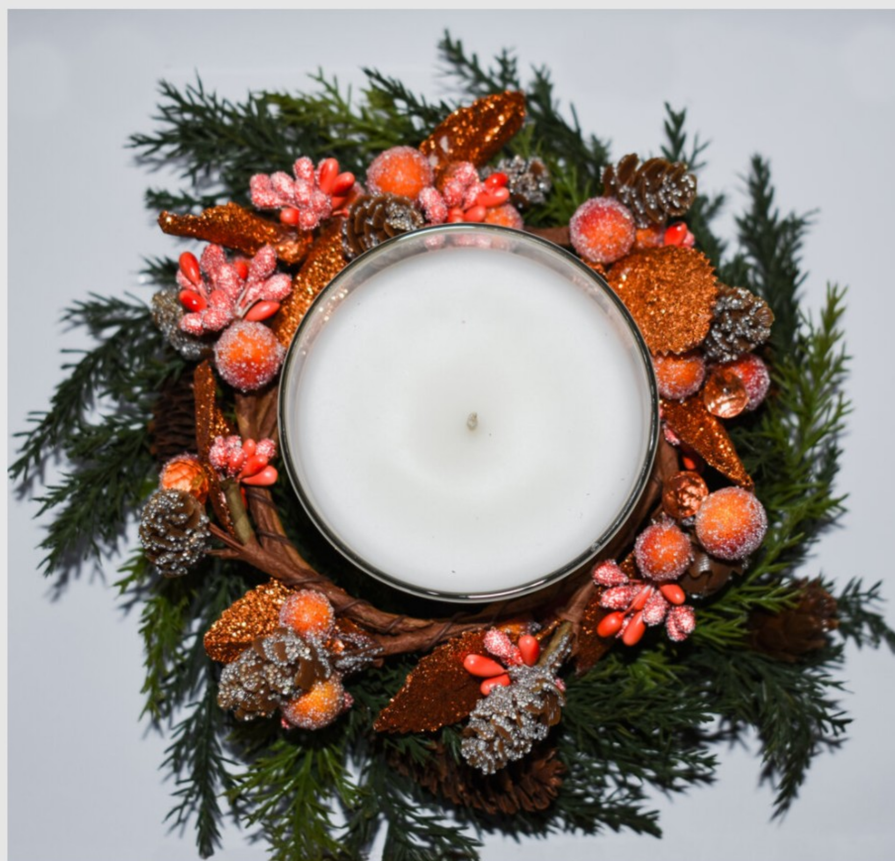
Salted Caramel Candle $20.00

Imagine a walk in the pine forest to choose a Christmas tree. There is a hint of snow in the air, and you wrap your scarf to ward off the cool, crisp chill. The fir trees are heavy with aromatic resin, and green sappy pine needles. As you trim the tree to take it home, the cedary woodiness gives depth to the scent. Decorating the tree with lady apples, clementines and spice garlands of cinnamon and clove complete the experience, combining all of the outdoor and indoor inspirations into one holiday scent.