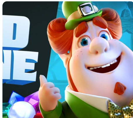
Win your share of $100,000 with NetEnt's...