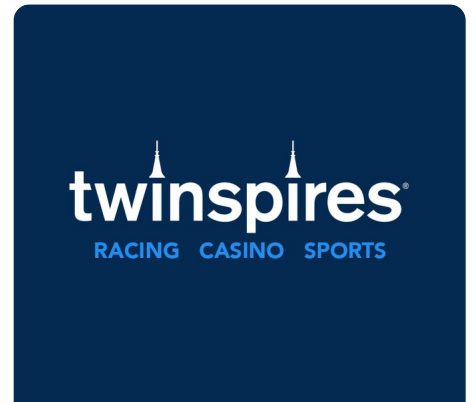
TwinSpires Launches Sports Betting in Arizon...