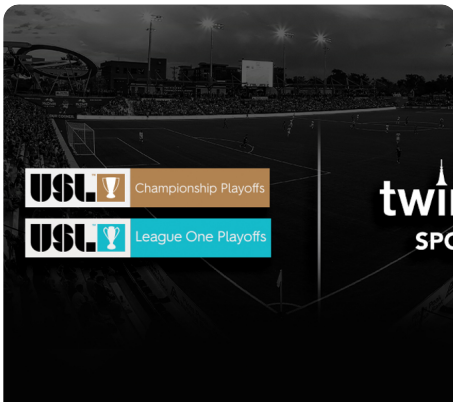
United Soccer League Announces TwinSpires ...