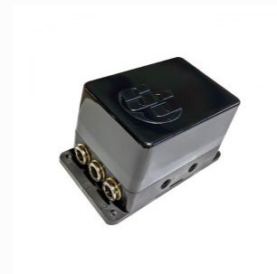
Slam Specialties 4-corner 3/8" valve manifold with 1/8" NPT