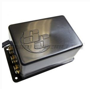
Slam Specialties 4-corner 3/8" valve manifold (Black)