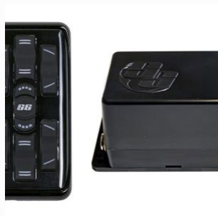
SV-8C & MC.2 Combo Pack