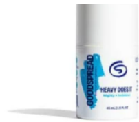
HEAVY DOES IT HYDRATOR Mighty + Ambitious