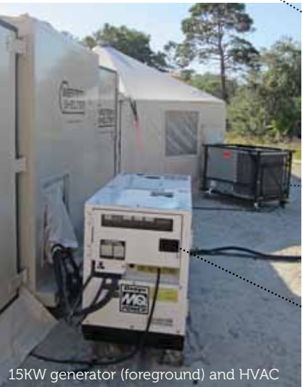
15KW generator (foreground) and HVAC