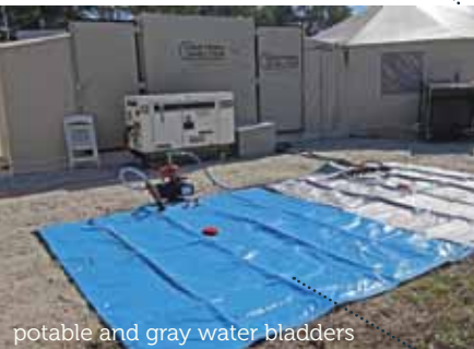
potable and gray water bladders