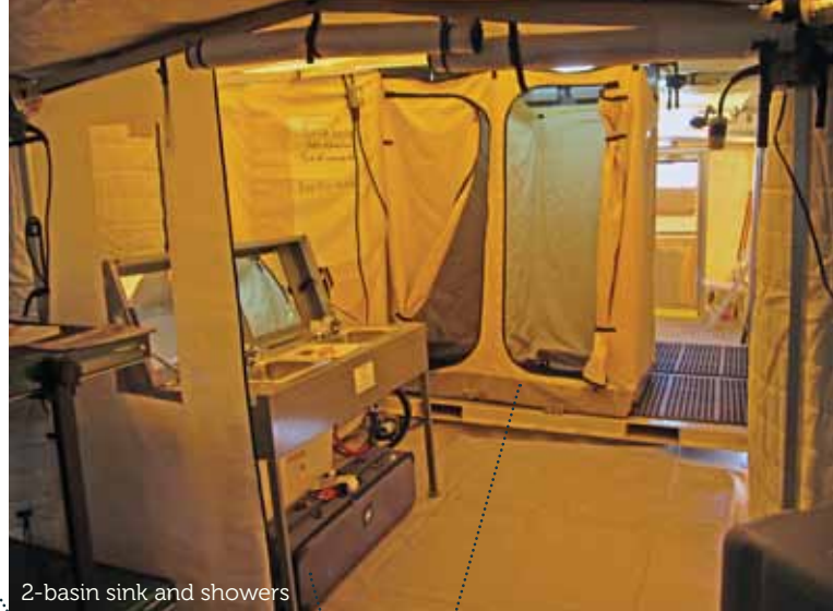
2-basin sink and showers