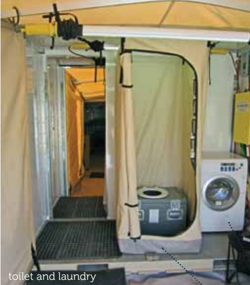
toilet and laundry