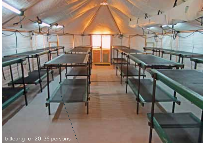
billeting for 20-26 persons