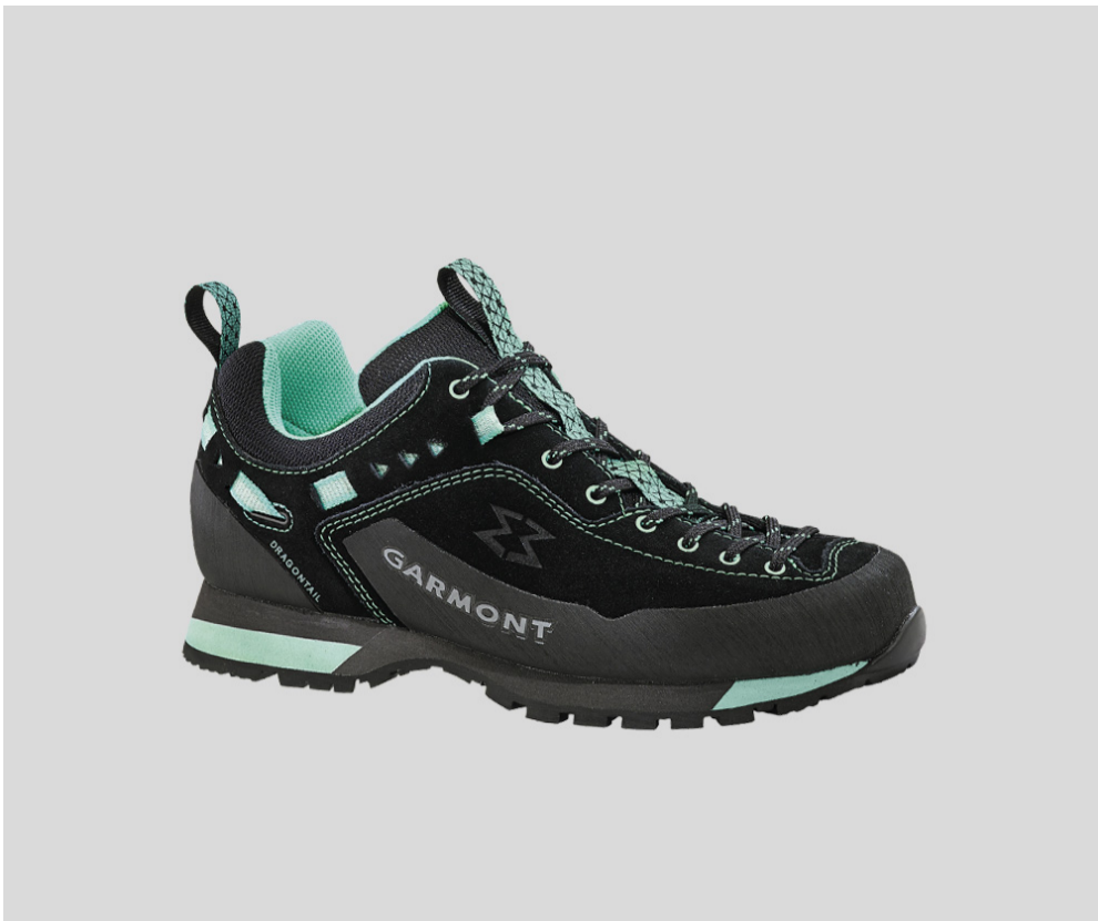
DRAGONTAIL LT WMS