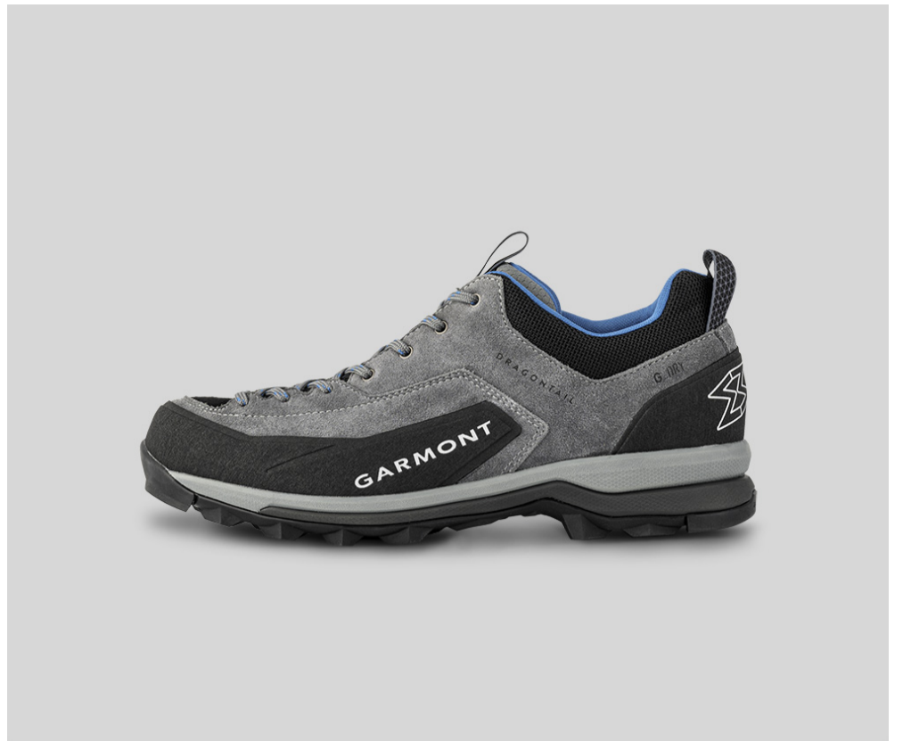
DRAGONTAIL G DRY