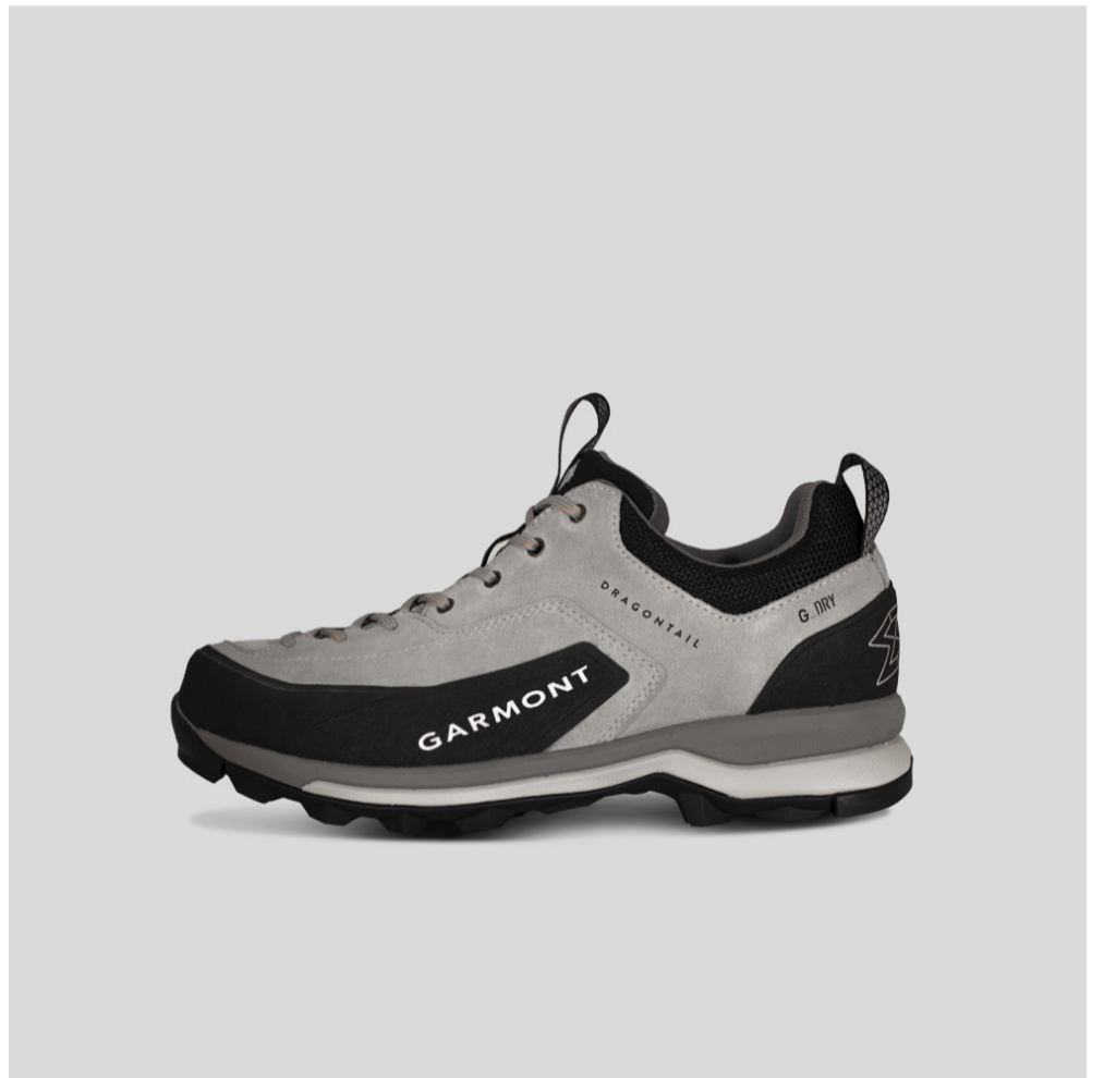
DRAGONTAIL G DRY WMS