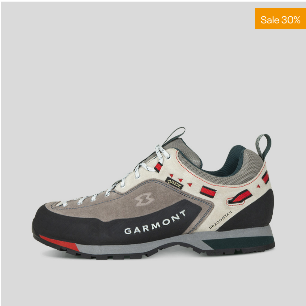
DRAGONTAIL LT GTX®