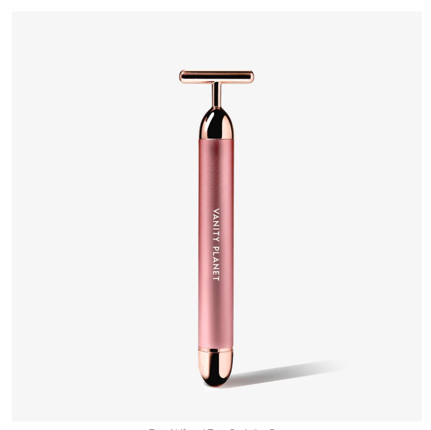
Tona | Lift and Tone Sculpting Bar. $ 59.00 Add to Cart