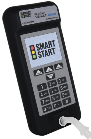
SmartMobile™ Versatile portable monitoring