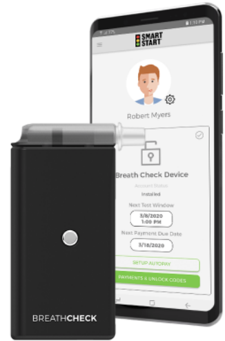
BreathCheck™ Low-cost app-based monitoring