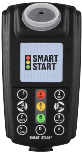
Ignition Interlock #1 in the U.S. & worldwide