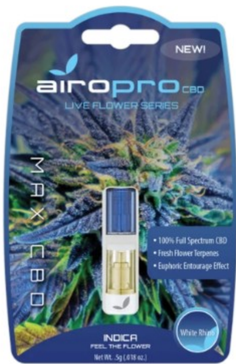
AiroPro CBD Live Flower Series - White Rhino CBD Cartridge - Indica