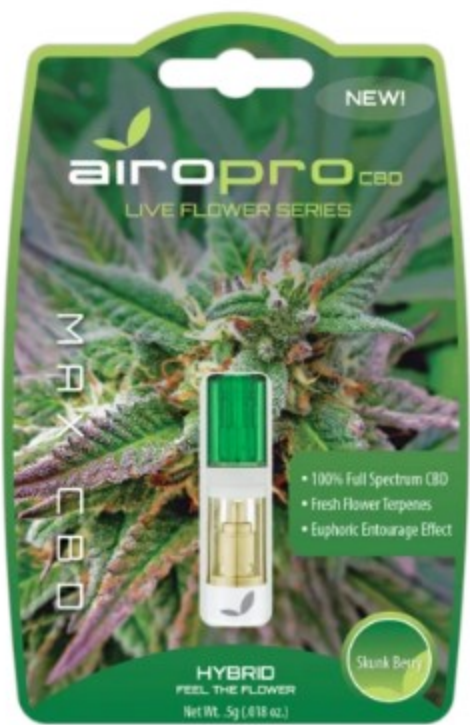
AiroPro CBD Live Flower Series - Skunk Berry CBD Cartridge - Hybrid