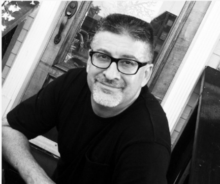
Gregg Home Services

Thousands of contractors have joined Knowify to improve their businesses. Check out their stories to see how they did it.