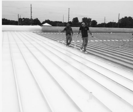
Safe Harbor Commercial Roofing

"I can't tell you how much time you've saved me."