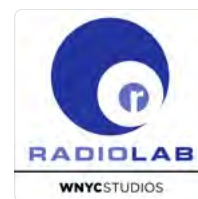
Radiolab WNYC Studios