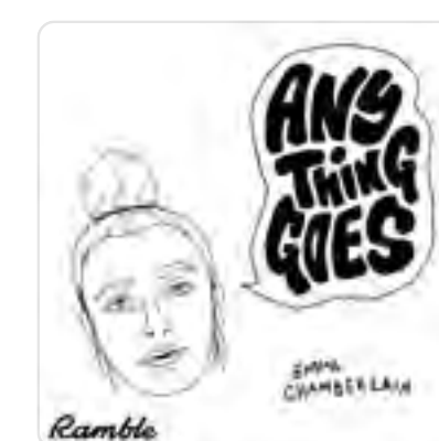
Anything Goes with... Emma Chamberlain and ...