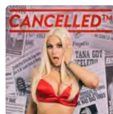
Cancelled with Tan... Tana Mongeau