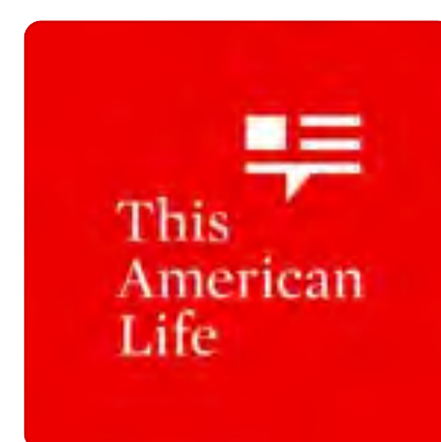
This American Life This American Life