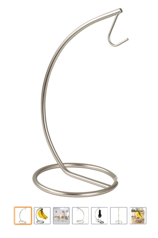
Home & Kitchen > Kitchen & Dining > Storage & Organization > Dinnerware & Stemware Storage > Mug Hooks

Euro Holder, Fruit Tree, Sturdy Steel Banana Hanger & Soft Pretzel Display for Home or Bar, Countertop Food Storage, 1 Count, Satin Nickel Visit the Spectrum Diversified Store ★★★★ ✓ 797 ratings Amazon's Chocin Home Storage Hoo... List Price: $17.99 Details Price: $15.98 ✓prime FREE One-Day & FREE Returns You Save: $2.01 (11%) Get 5% back ($0.79 in rewards) on the amount charged to your Amazon Prime Rewards Visa Signature Card. Color: Satin Nickel Style Name: Banana Holder Banana Holder Bread Basket Material Steel Color Satin Nickel Mounting Countertop Type Finish Gold Type Brand Spectrum Diversified