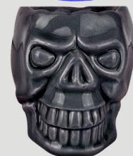
SMALL SKULL BOWL AVAILABLE IN 10 COLORS