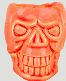
LARGE SKULL BOWL AVAILABLE IN 10 COLRS