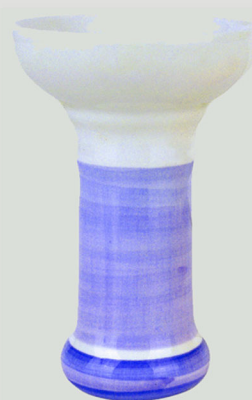
LONG BOWL HB-08