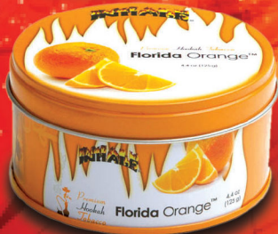
Florida Orange 125g