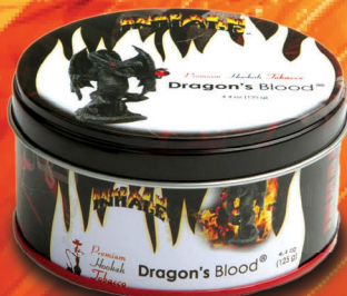
Dragon's Blood 125g