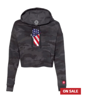
Raise The Flag Crop Hoodie $47.99 $49.99