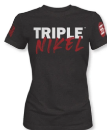
Vintage Black - Women's Team Shirt from $24.99