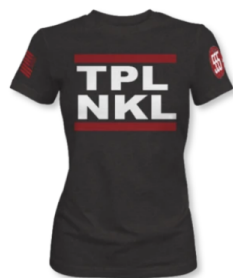
TPL NKL Vintage Black Women's Tee $24.99