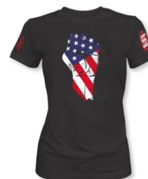
Raise The Flag - Womens from $24.99