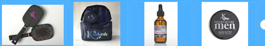
$8.99 $14.99 Kaleidoscope Brush