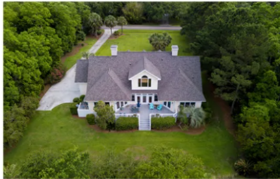
High-definition aerial imagery