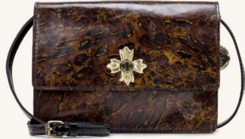
Consilina Crossbody Organizer