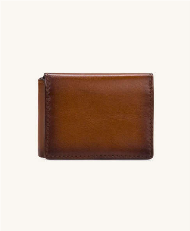
L Fold Wallet Hand Stained