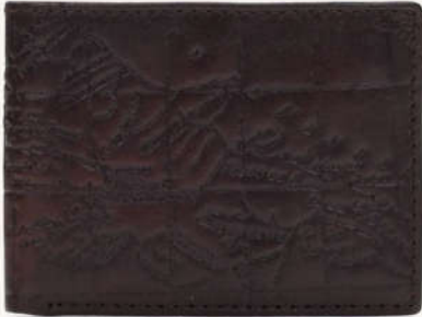
Double Billfold Wallet