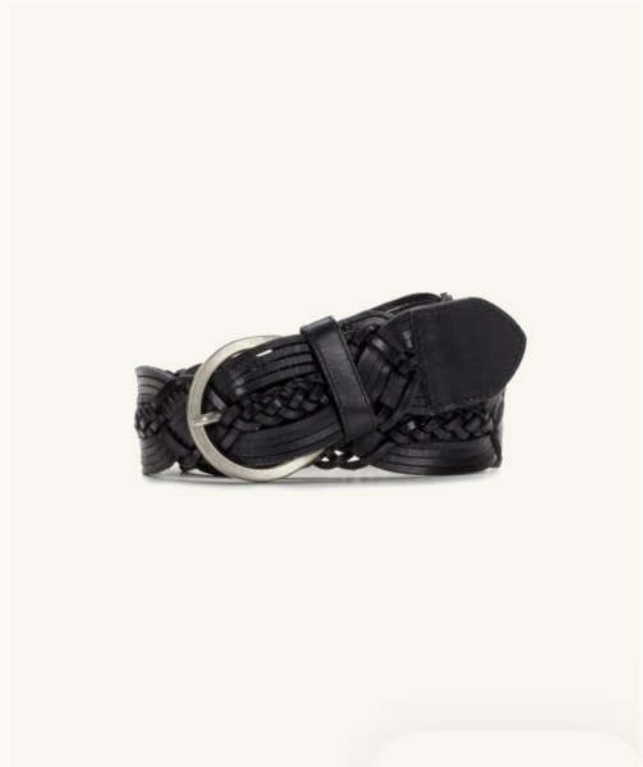
Catullo Braided Black