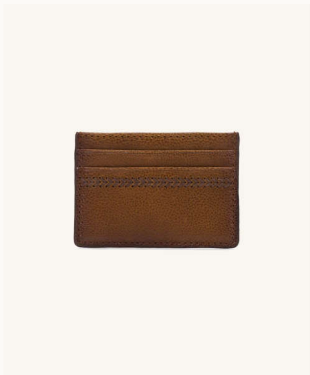
Slim Card Case