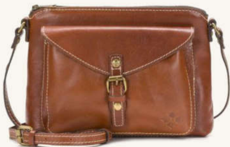
Avellino Crossbody Heritage