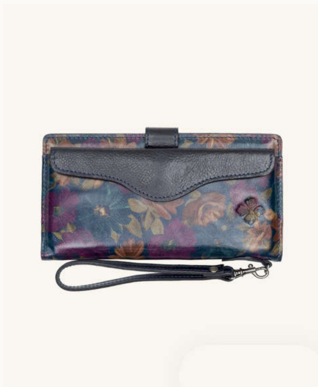
Valentia II Wallet