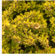
Sunsation® Japanese Barberry Berberis thunbergii 'Monry' Can. Plant Breeders Rights #3487 ★★★★★ From: $19.99