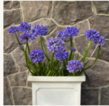
Midnight Blue® Lily of the Nile Agapanthus 'Monmid' ★★★★★ From: $19.99