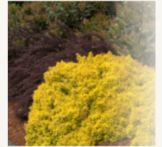
Golden Nugget™ Dwarf Japanese Barberry Berberis thunbergii 'Monlers' Can. Plant Breeders Rights #3489 ★★★★★ From: $19.99