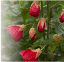
Super Red® Flowering Maple Abutilon x 'Moned' From: $16.99