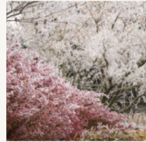
Cherry Bomb® Japanese Barberry Berberis thunbergii 'Monomb' Can. Plant Breeders Rights #3488 ★★★★★ From: $19.99