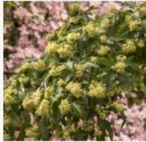
Red Rhapsody® Amur Maple Acer tataricum subsp. ginnala 'Mondy' From: $70.00