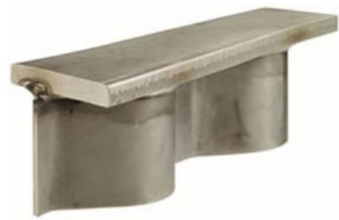
BASS™ Bottom Ash Seal Skirt

Attack the most aggressive situation in offering a Doubler Plate at the air/gas interface to combat corrosion. Additionally, we engineered an option to combat corrosion utilizing our exclusive Nano Coating, at the waterline on the hot and cold sides of seal.