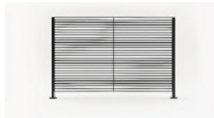
Half-Inch Horizontal Rod