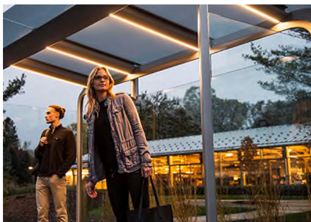
Related Products: Connect 2.0