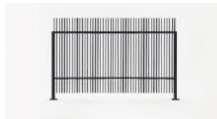
Half-Inch Vertical Rod