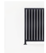
Vertical Louver - 7