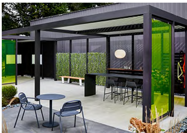
Related Products: Upfit