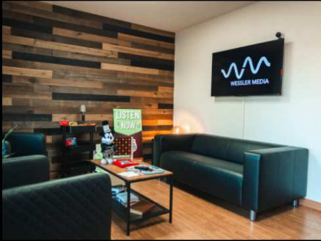
Lobby and lounge.