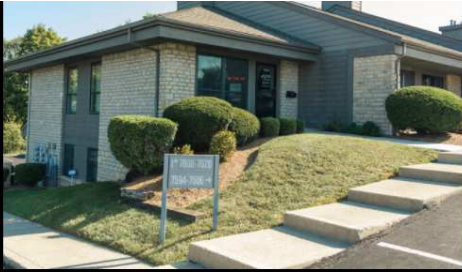
Our studio offices.