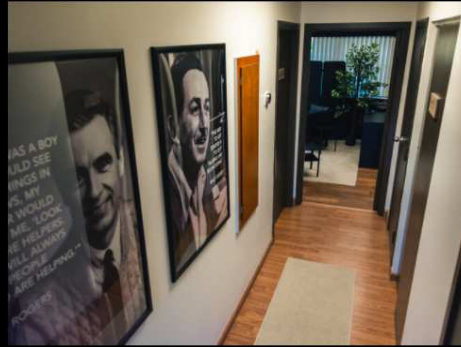
Hallway to studio.