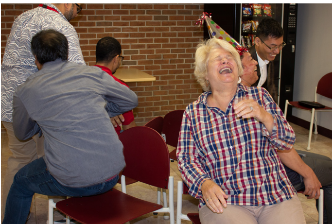
MMRI staff gets cozy with the classical game of musical chairs.