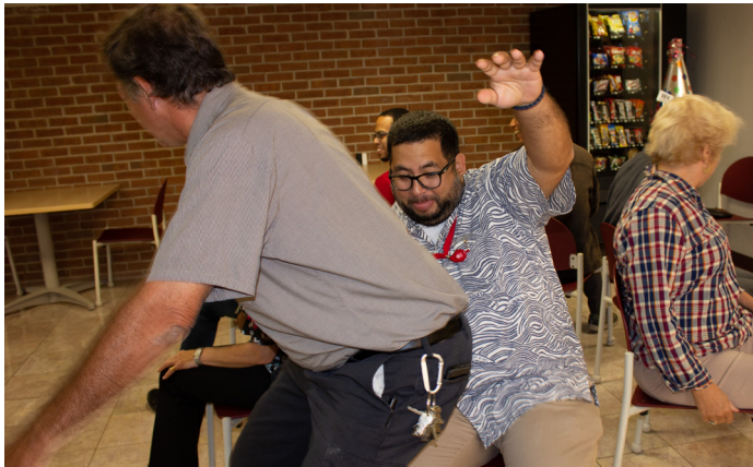
MMRI staff gets cozy with the classical game of musical chairs.