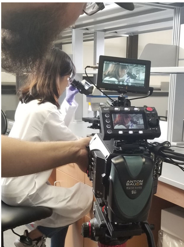
Mohawk Valley Pictures captured b-roll of MMRI labs for the new feature video.

MMRI teamed up with Mohawk Valley Pictures this summer to begin filming a new development video focusing on the Institute, its mission, and more importantly, the research. The video showcases the newly renovated facility and state of the art equipment, while highlighting researchers and their work, and the vision of our Board and Director of Research. Along with the full length video, several short "sizzle" videos will focus in on a particular area of research. We look forward to this opportunity to expand the outreach, awareness, and vision of MMRI in an exciting and timeless way.