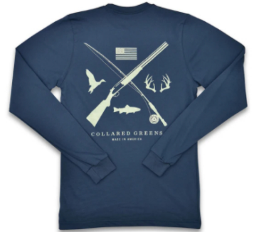
FIELD & STREAM: LONG SLEEVE T-SHIRT - STEEL BLUE