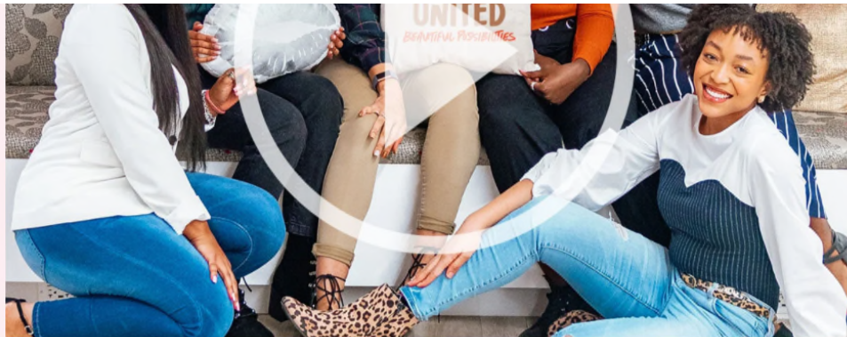
Episode 1: A Wonderful Day for Possibilities