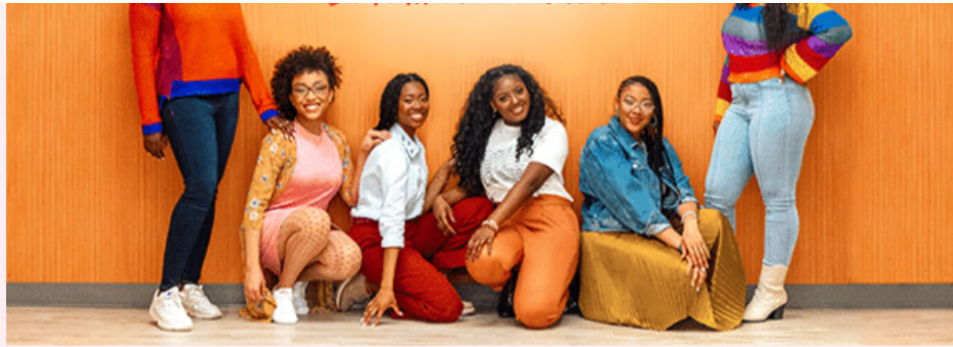
Get to Know Our Girls: Part One