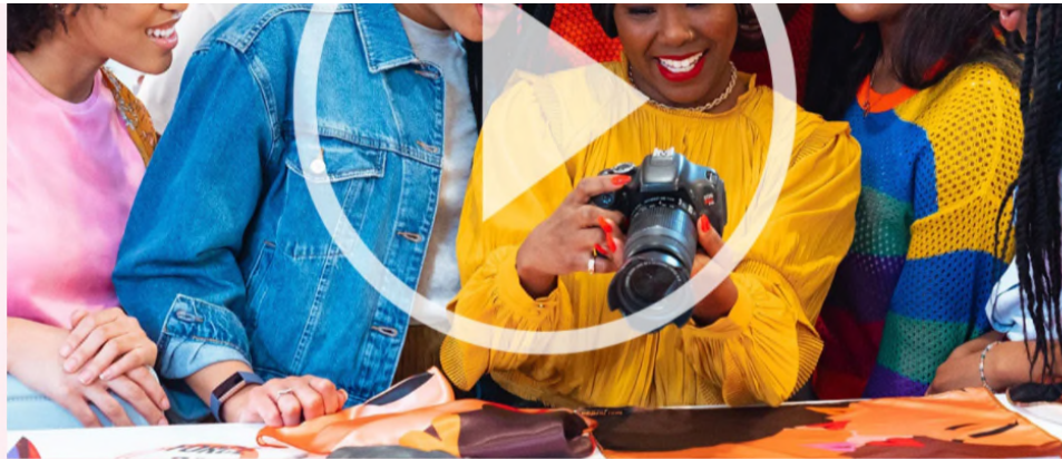
Episode 3: Dreams Take Shape