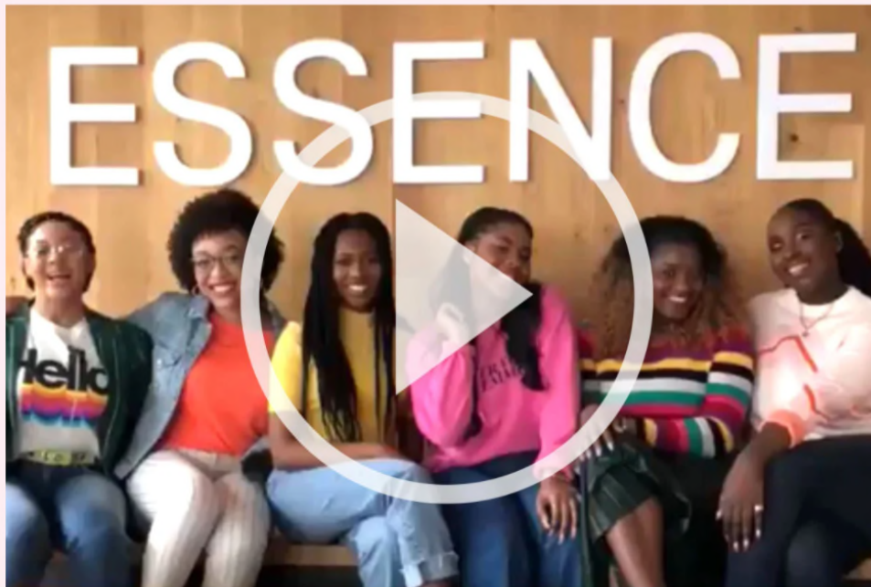
Episode 4: How to Make A Statement