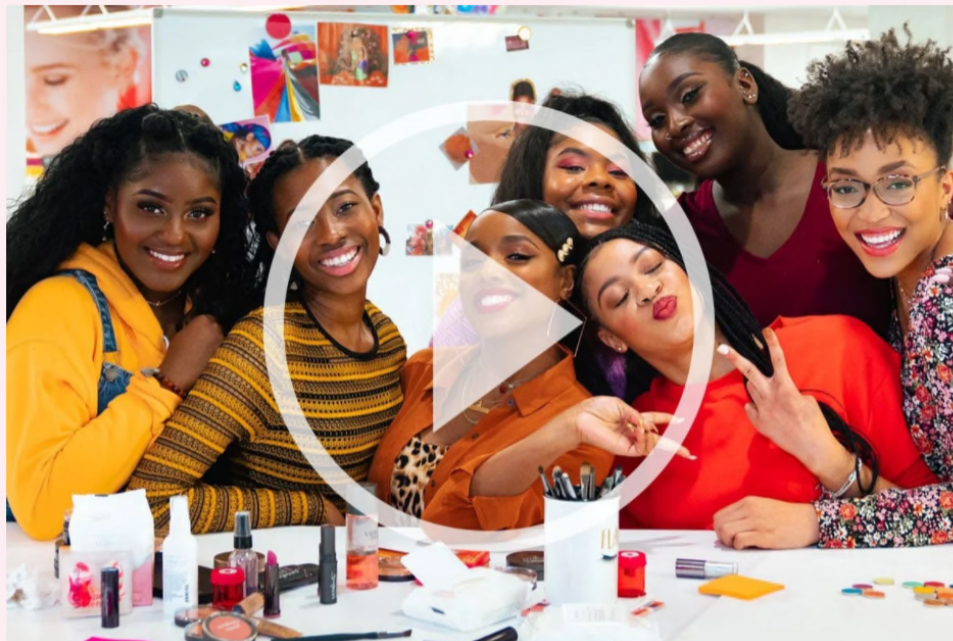
Episode 2: Opportunity of a Lifetime