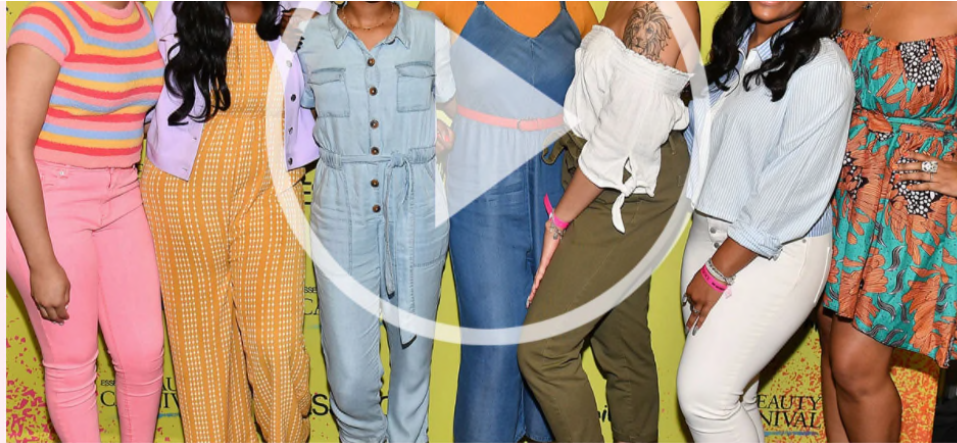
Episode 5: A Stage-Worthy Product Reveal