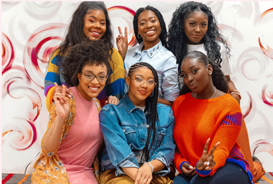
Get to Know Our Girls: Part Two